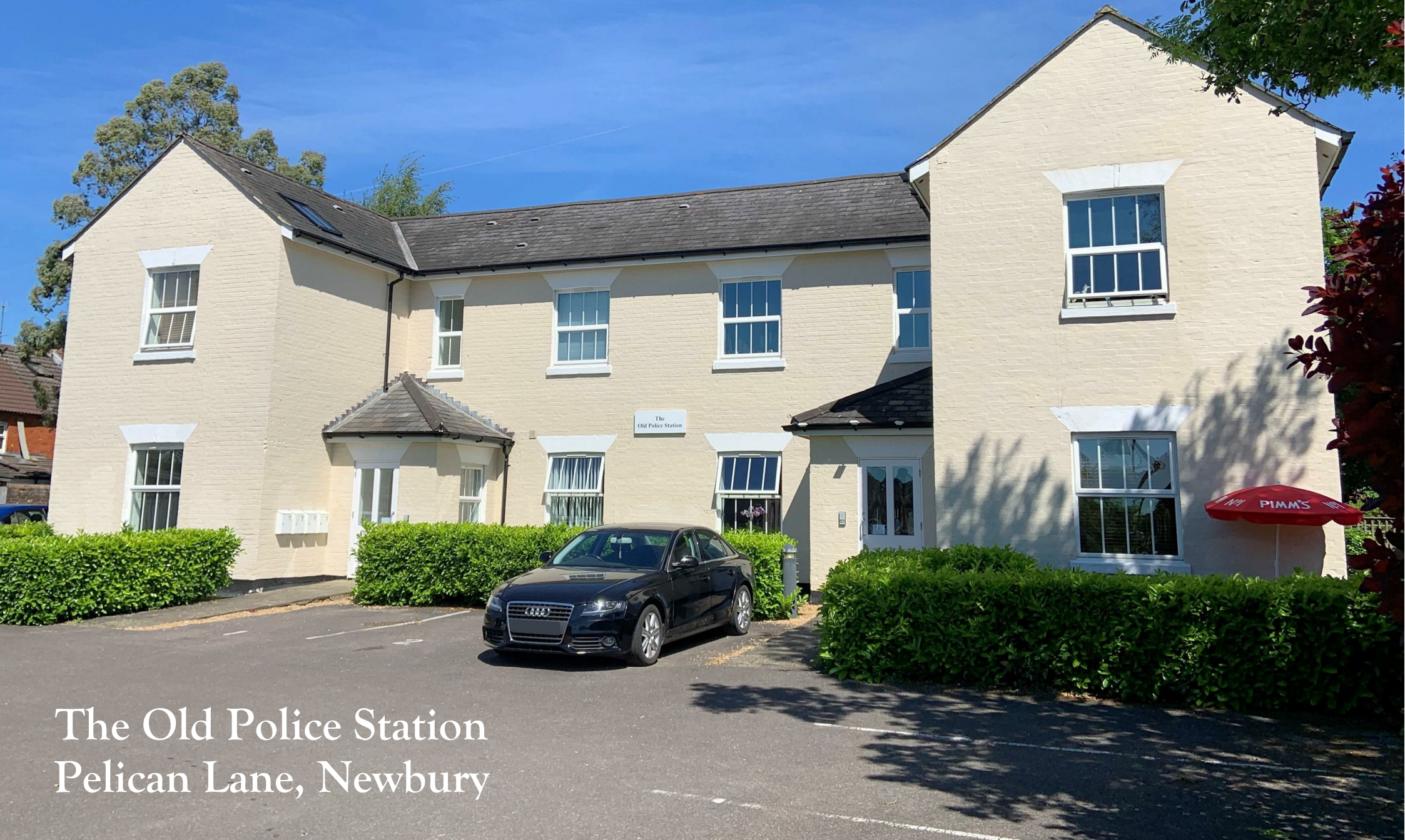
The Old Police Station Pelican Lane, Newbury